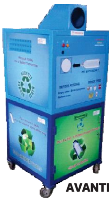
AVANTI BS 200 P