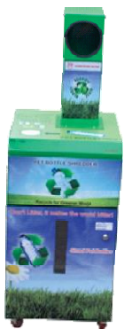
AVANTI BS 100 P