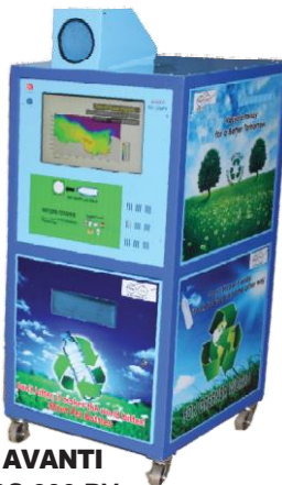
AVANTI BS 200 PV